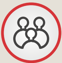
Long Range Detection