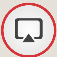
4.3" Capacitive LCD