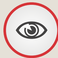
Live Face Detection