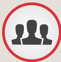
Visible Light Facial Recognition